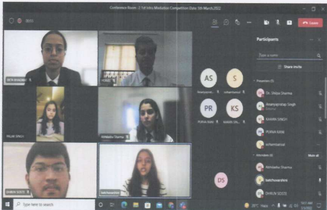
Screenshot from Conference Room No. 2