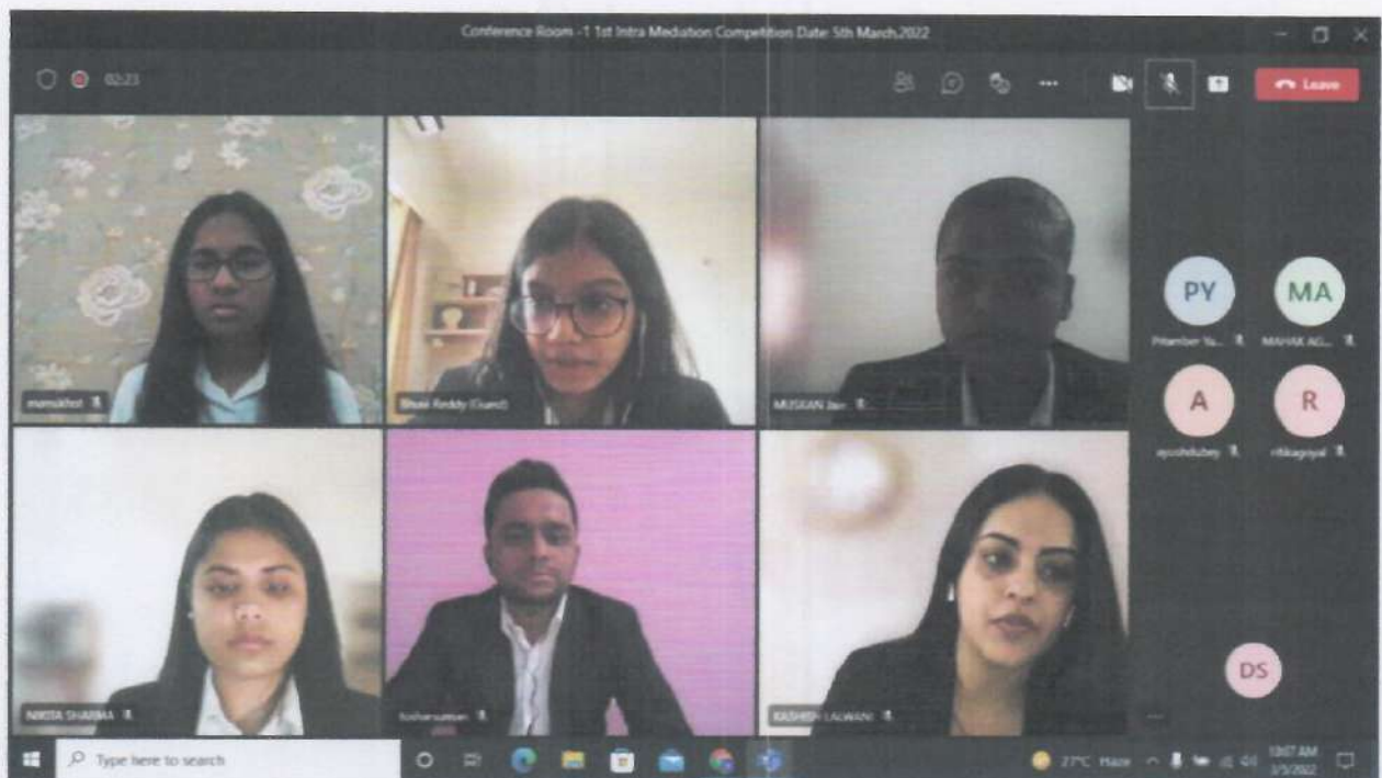
Screenshot from Conference Room no.1