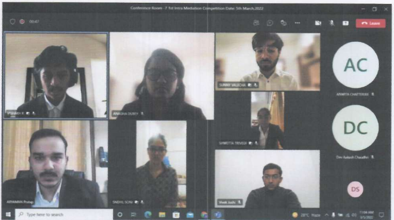
Screenshot from Conference Room No. 7