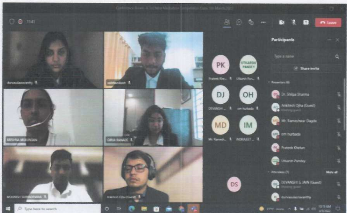
Screenshot from Conference Room No. 6