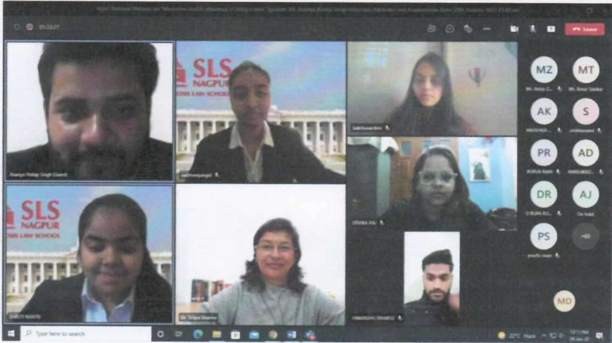
Group photograph taken during the session and screenshot of more than 100 students participated in the session.