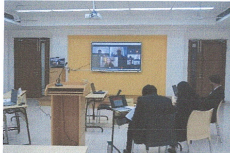
Ms. Vatsala Pandey judging the Prelims 1 & 2 through remotely

The Semi-Finals were conducted in two rooms, with four judges presiding over the proceedings.