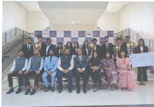
Winners of the competition

After the final round of arbitration and the valedictory ceremony, the judges provided detailed feedback on the teams' performances, highlighting areas of strength and suggesting improvements. The competition also served as a platform for networking, as it brought together legal professionals, students, and faculty from across the globe, facilitating valuable exchanges of knowledge and perspectives on international arbitration.