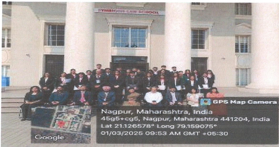
The group photo with Dignitaries

These distinguished dignitaries and attendees contributed significantly to the success and prestige of the Inaugural International Arbitration Competition, 2025.