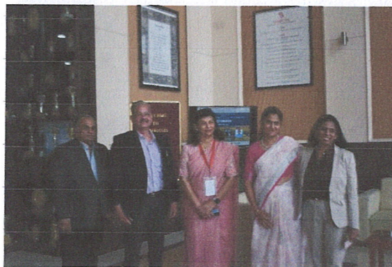
The Judges for Semi Finals.

The Semi-Finals were conducted in two rooms, with four judges presiding over the proceedings.