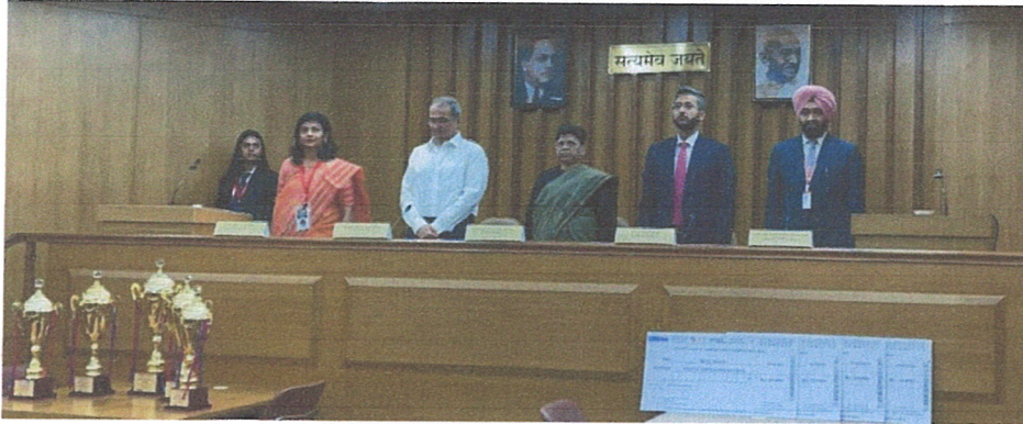
The Inauguration ceremony.