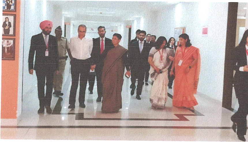
Arrival of the guest