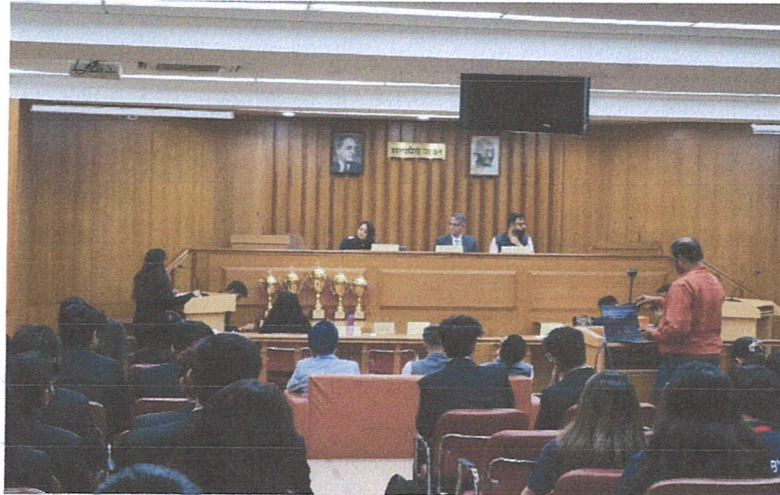
The Judges for the final rounds.

The Finals featured a panel of three judges, ensuring a rigorous and well-evaluated conclusion to the competition.