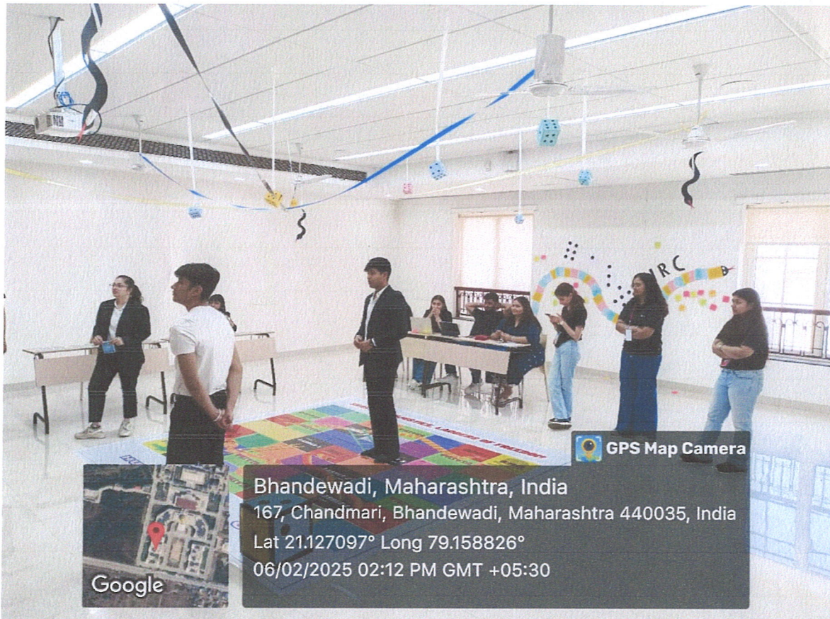
Participants Engaged in the “ Snakes of Injustice, Ladders of Freedom ” Board Game Event